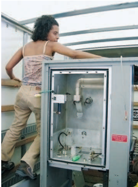
Figure 1 Volunteer securing transmitter inside the truck

operational, one transmitter would produce an RF signal of about 10,000 watts, and the other, around 1,000—in marked contrast to LPFM transmitters, which by law cannot exceed 100 watts (about the same power as an incandescent lightbulb) and with which the radio activists commonly worked. The transmitters were thus unfamiliar to the core activists due to their power and scale, as well as not being solid-state. They were about the size of refrigerators and weighed so much that they could not be brought into the activists’ normal workspace in a church basement, because they would damage wood floors and were close to impossible to move up and down stairs. Storage and moving were thus nontrivial; the activists rented a large truck and a pallet jack to transport the transmitters to the workshop site and conducted the workshops inside the truck bed and outside on folding chairs and tables set up on the church sidewalk next to the truck. The transmitters required serious electrical current to run, so activists tried to obtain a generator before the workshop began. This proved expensive and difficult; ultimately, the activists decided that the transmitters needed so much work