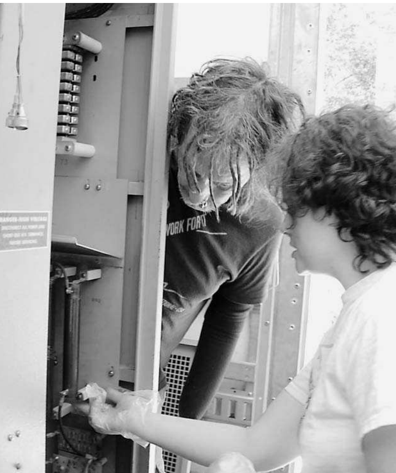
Figure 5 Volunteer cleaning a transmitter while engineer looks on

ment continued. Novice participants found themselves restricted to either cleaning components or helping with meals; none too pleased with this division of labor, they took breaks in which they sat around chatting with one another and ruing the fact that they did not know how to “plug into” the technical work and did not feel especially welcome to do so (field notes, May 29, 2005).